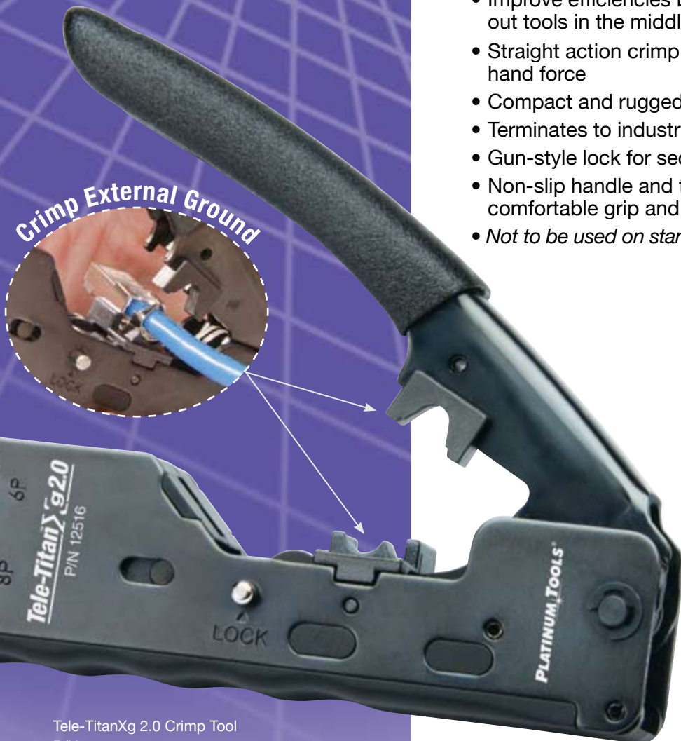
Crimp External Ground