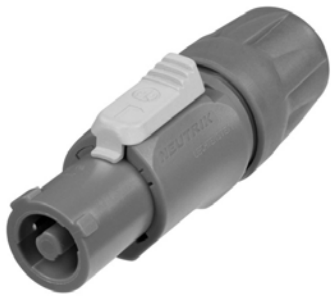
Neutrik 20A powerCON Power input Connector NAC3FCA