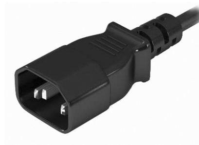
10A C14 Output Connector Plug